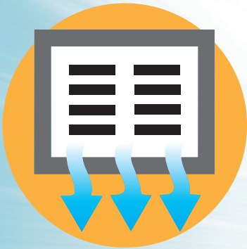
1. Vents blowing cold air in heat mode

Here are six common home heating symptoms from IT Landes to help you decide if it's time to act: