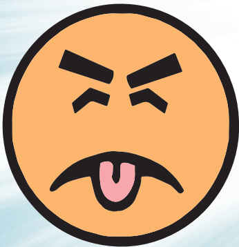
4. Strange or musty odors