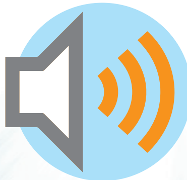
5. Loud noises, rattling, or shaking