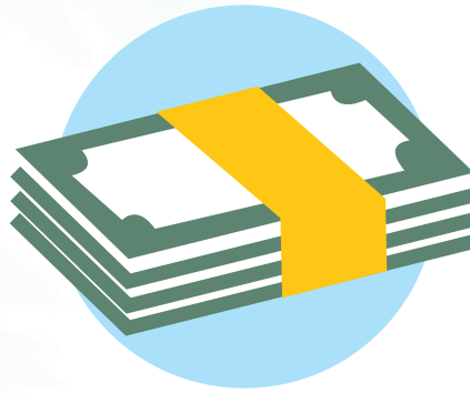
2. Increasing utility bills